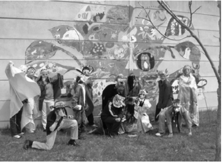
The Tempest and Mural 2009