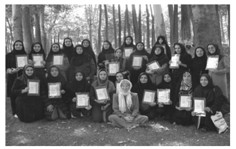
Graduation in the Forest –Tehran 2008