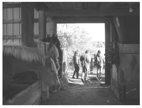
Project Centaur - Kitchener 2007

In honoring nature/culture and to mitigate the ubiquitous consumerism that afflicts 'firstworld' society we might find a way to follow our hearts and perhaps ignore temptations to swallow our planet.