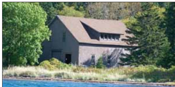
Alexander Graham Bell Property, Baddeck, Nova Scotia Montessori began here in Canada in 1912

November 2 nd and 3 rd , 2012 The Old Mill Inn, Toronto